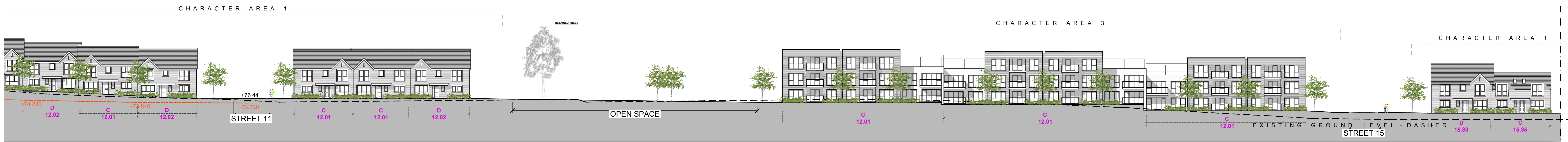
Section AA 2 1:250 @ A0